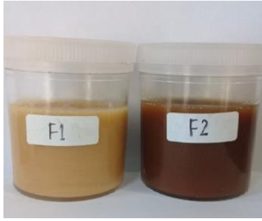
Figure 2. A. bilimbi fruit extract liquid hand soap: Hand soap contains 5% A. bilimbi fruit extract (F1), Hand soap contains 10% A. bilimbi fruit extract (F2).